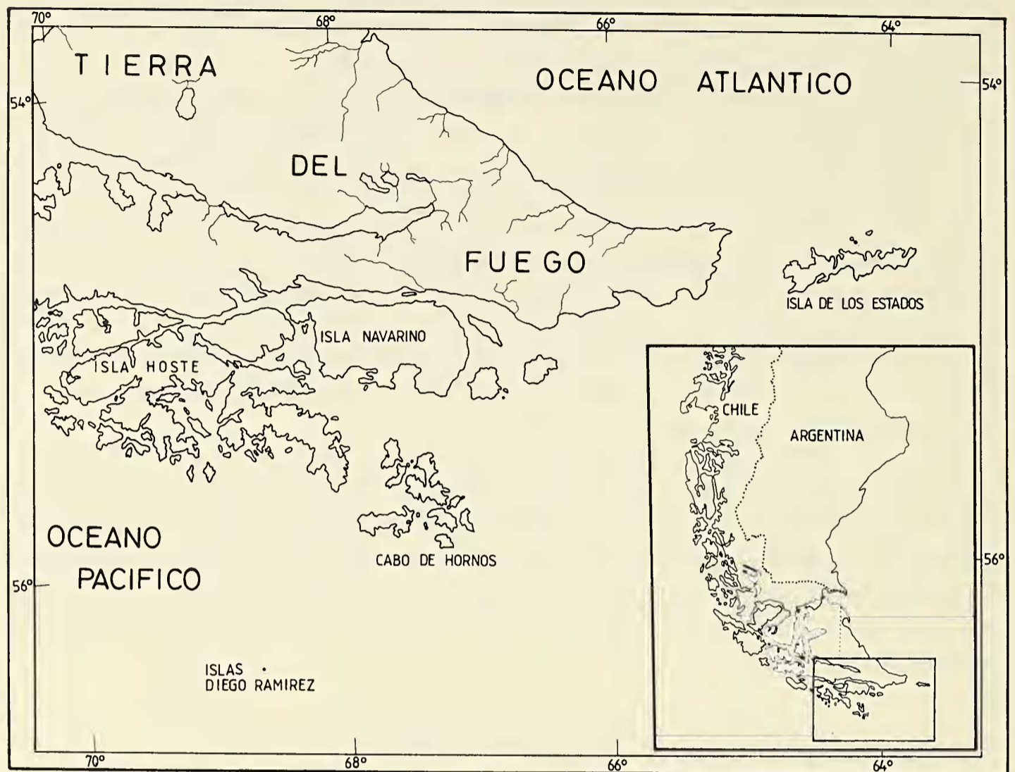
Fig. 1.—Map of southern tip of South America, showing Cape Horn Archipelago and other localities where opilionids have been reported.

and the coldest month medium temperatures of 5^{\circ}\text{C} (i): its rainiest season, although not so marked, is autumn (w'); it is very cold, with a mean monthly temperature lower than 18^{\circ}\text{C} , but those of the coldest months are higher than -18^{\circ}\text{C} (k') and during the four warmest months the mean is lower than 10^{\circ}\text{C} (c).